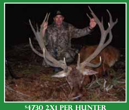
$4730 2XI PER HUNTER $5960 1X1 PER HUNTER $4100 NON-HUNTING COMPANION